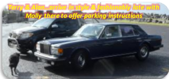
Terry & Alan...arrive in style & fashionably late with Molly there to offer parking instructions