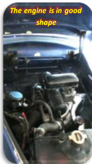
The engine is in good shape