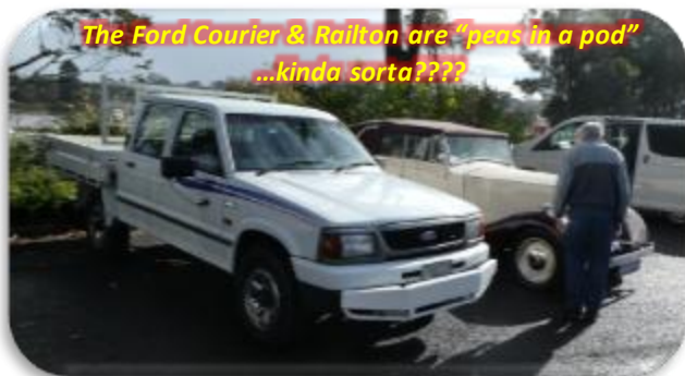
The Ford Courier & Railton are "peas in a pod" ...kinda sorta???