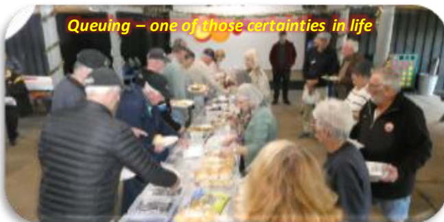
Queuing – one of those certainties in life