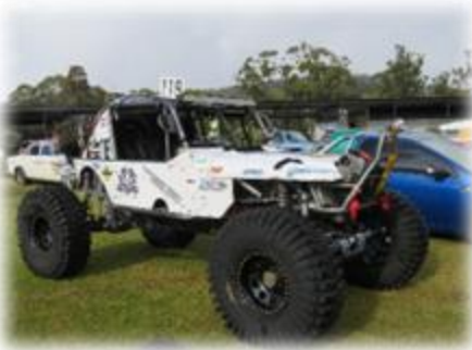
Some examples of the rare and/or exotic wheels present on the day were (clockwise from top left): 1950 Fiat 1400; Corvette; Austin Mini Traveller (woody); Aston Martin; Lotus; Porsche; Morris Mini Ute; and a Monster thingo