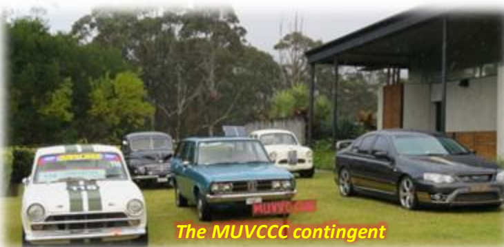
The MUVCCC contingent