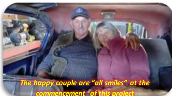
The happy couple are "all smiles" at the commencement of this project