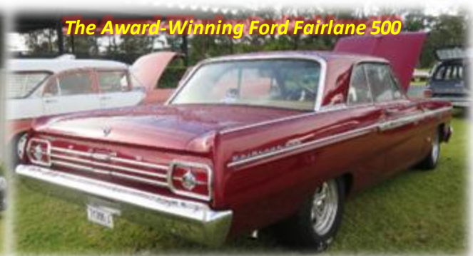
The Award-Winning Ford Fairlane 500