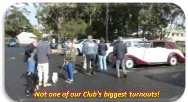
Not one of our Club's biggest turnouts!