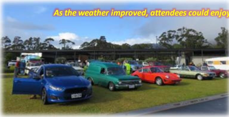
As the weather improved, attendees could enjoy the variety of vehicles on display