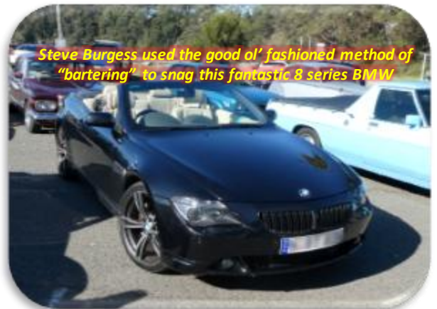
Steve Burgess used the good ol' fashioned method of "bartering" to snag this fantastic 8 series BMW