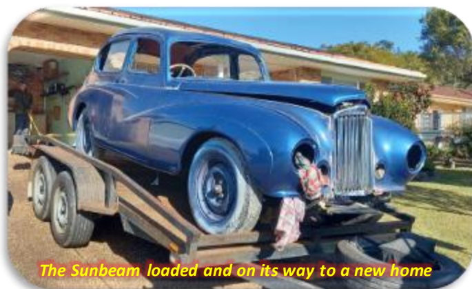
The Sunbeam loaded and on its way to a new home

Stay tuned!! Future issues will report on the progress of the restoration of the Dawn Sunbeam .