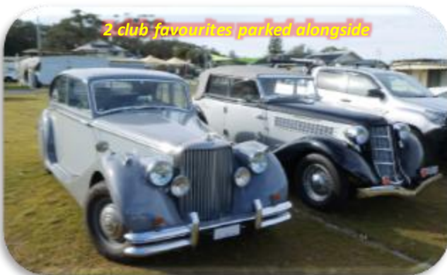
2 club favourites parked alongside