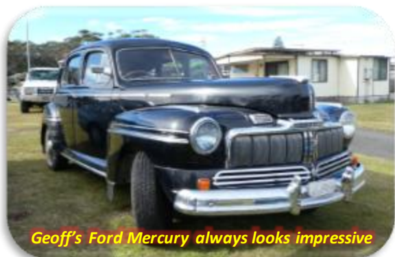
Geoff's Ford Mercury always looks impressive